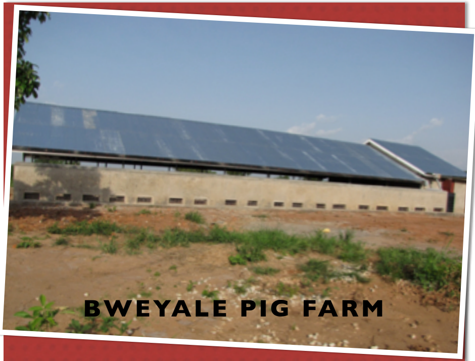
BWEYALE PIG FARM