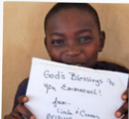
Letters from you!