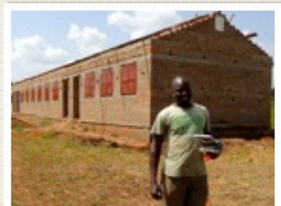
BOBI VILLAGE SCHOOL