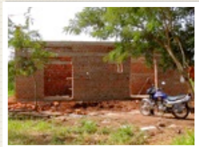
BOBI PUMP HOUSE