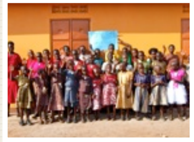
KINDNESS GIRLS HOME