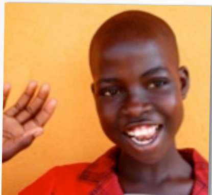
Big wave and smile!